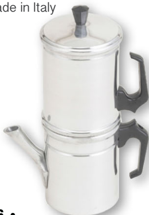
8946 • Neapolitan Coffee Maker AL, 6 cup (bx)