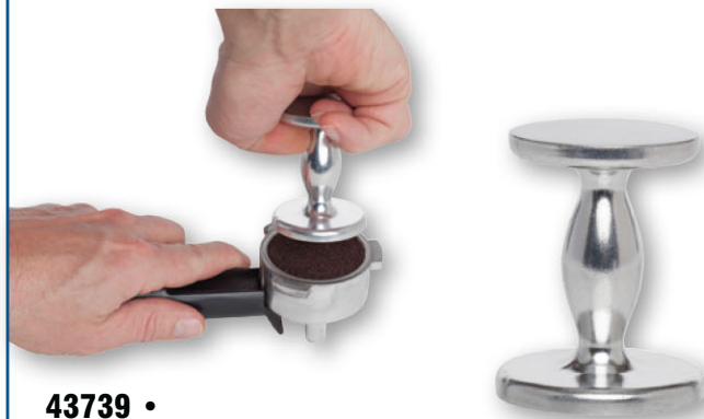
43739 • Espresso Tamper AL, 2 3/4" (cd)