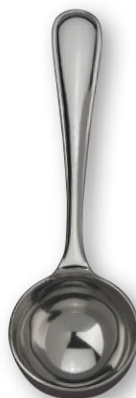
726S • Coffee Measure SS, 5 3/4", 1 Tbsp.