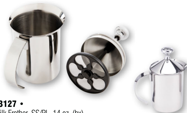
43127 • Milk Frother, SS/PL, 14 oz. (bx)