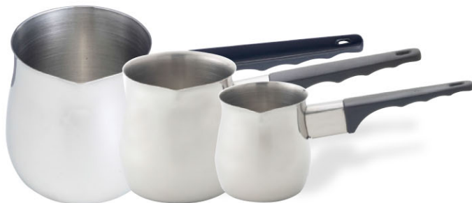
45824 • Turkish Warmer SS/PL, 24 oz.