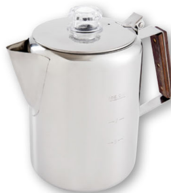
43803 • Percolator 18/8 SS/PL, 9 cup (bx)