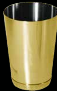
HB46/X-034-G-012 TOBY TIN GOLD H: 5 1/2" 1 doz.