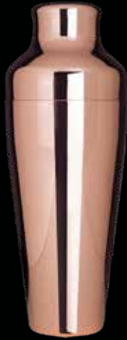
HB46/MSHAKER-C-012 M SHAKER COPPER H: 9" 1 doz.