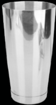
HB46/X-005-012 BOSTON TIN WEIGHTED H: 7" 1 doz.