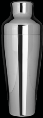
HB46/MSHAKER-012 M SHAKER H: 9" 1 doz.