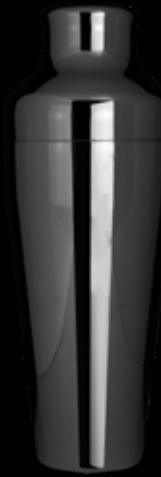
HB46/MSHAKER-PB-012 M SHAKER BLACK H: 9" 1 doz.