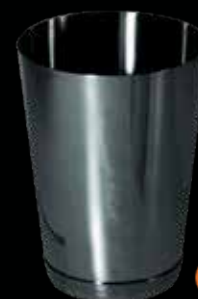
HB46/X-034-PB-012 TOBY TIN BLACK H: 5 1/2" 1 doz.