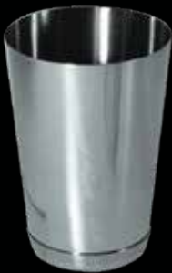
HB46/X-034-012 TOBY TIN H: 5 1/2" 1 doz.