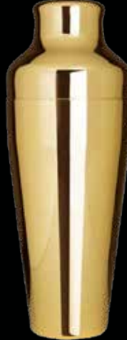
HB46/MSHAKER-G-012 M SHAKER GOLD H: 9" 1 doz.