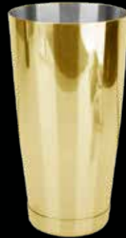
HB46/X-005-G-012 BOSTON TIN WEIGHTED GOLD H: 7" 1 doz.