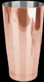
HB46/X-005-C-012 BOSTON TIN WEIGHTED COPPER H: 7" 1 doz.