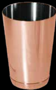
HB46/X-034-C-012 TOBY TIN COPPER H: 5 1/2" 1 doz.