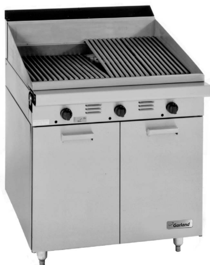
Model MST34B Range-Match Char-Broilers