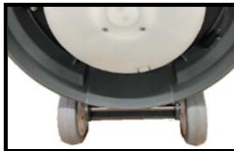
Wheels for easy transportation.

Easy to operate No Torque No Gouging No Swirling