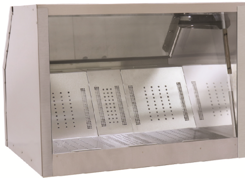
Customer Side (General image shown for reference only.)