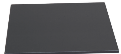
CAP-Q Quarter Size Pizza Heat Plate

**Due to continual product improvement, all product specifications, designs, and prices are subject to change without notice.