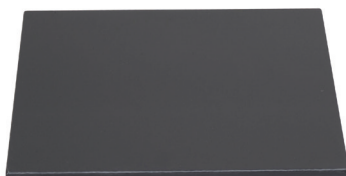
CAP-F Full Size Pizza Heat Plate

Pizza Heat Plate shelves are available for every size Cadco convection oven!