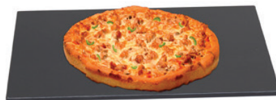
CAP-H Half Size Pizza Heat Plate