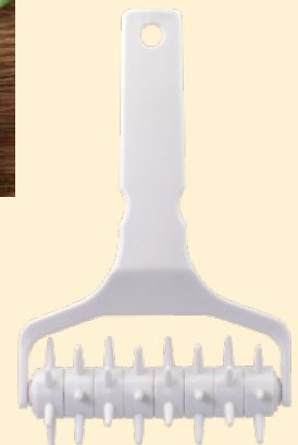
43843 • Dough Docker PL, 5" x 8" (cd)