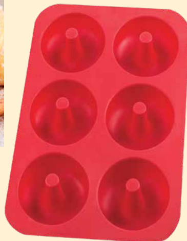
43840 • Donut Pan Silicone, 10 1/4" x 7" x 1"