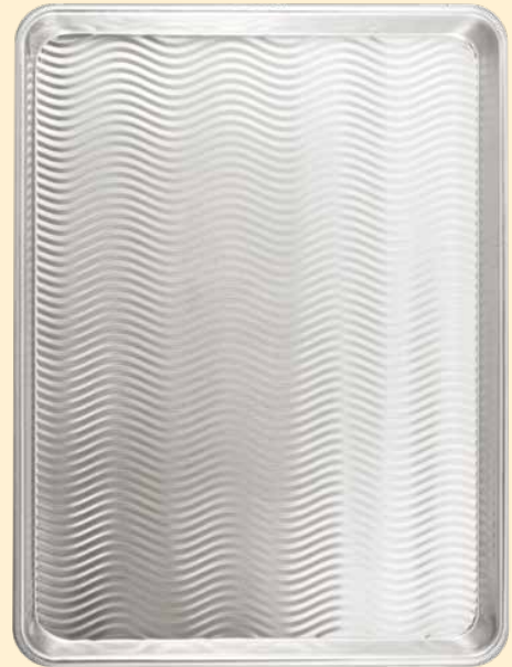
31821 • US Half-Size AirWave Pan AL, 13" x 18"