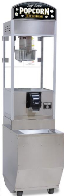
2783 (050) shown Front Counter Unit (Base included)