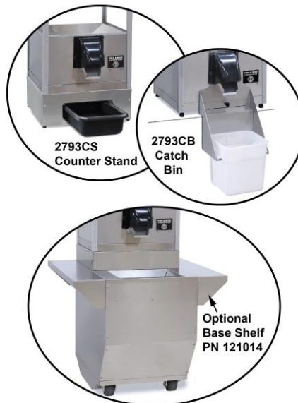
Optional Features (all sold separately)