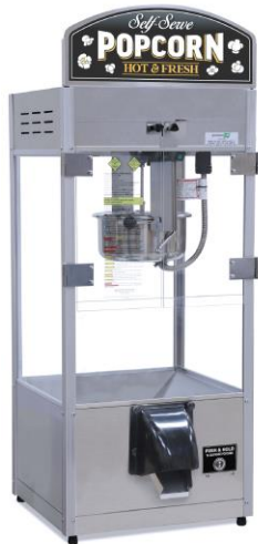
2783 (010) shown Back Counter Unit