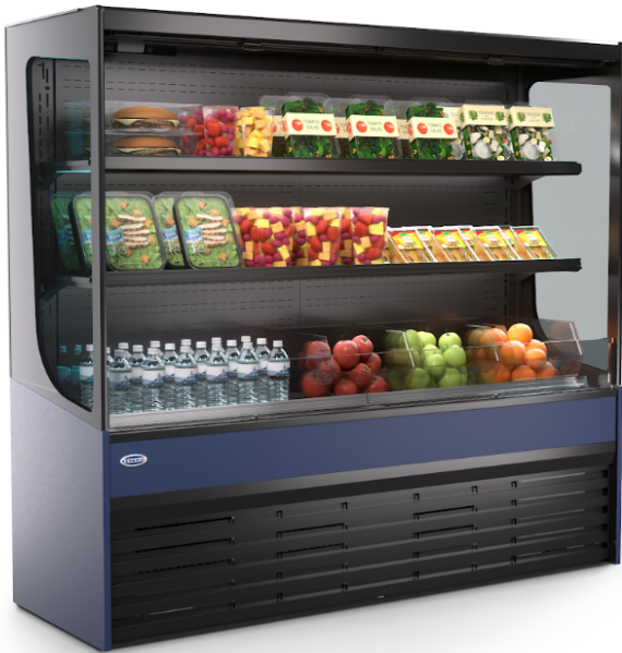
Model VRSL7260S Shown with Options

Designed to help you make the most of your limited space with a slim 24" depth while delivering a bold, attention-grabbing design that highlights your merchandise.