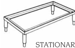
STATIONARY (-B) Raises Cabinet Off Floor. Adjustable Bullet Feet For Leveling