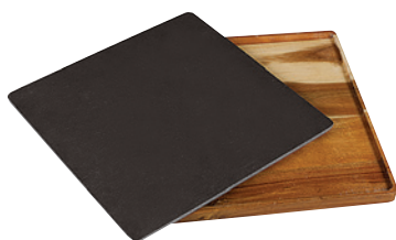
Square Slate with Acacia Base