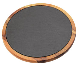
Round Slate with Acacia Base

These stylish serving boards combine the contemporary look of slate with the rustic appearance of Acacia wood, making for highly decorative displays. The durable pieces are traditionally used to serve cheese and charcuterie, but are also excellent for serving appetizers and desserts. Each slate can easily be removed from its base to be used alone or to chill in preparation for serving cold food. These eco-friendly slates are natural and therefore require hand-washing under warm water using a sponge or a nylon kitchen brush. To clean the Acacia base, wipe with a damp cloth and dry immediately; do not soak. Slates may chip or break if dropped.