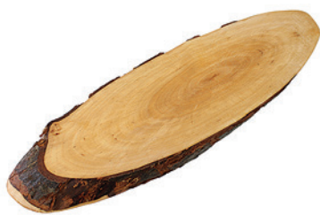
Oval Board with Live Edge, Alder