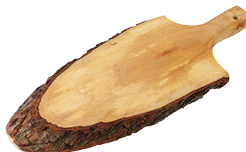
Oval Paddle with Live Edge, Alder