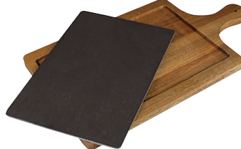
Rectangular Slate with Acacia Paddle