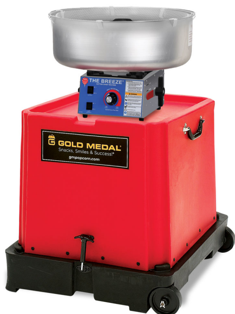
General U-Tote-It shown with Floss Unit for reference only (items sold separately)