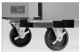
Standard 5" Castors