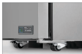
Low Profile (LP) 1½" Castors Upcharge applies for (LP) size castors