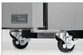
ADA 3" Castors