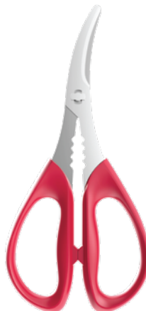
71005 • Seafood Shears 18/8 SS/PL, 7 1/4" (cd)