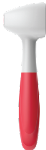
71004 • Dual-Head Seafood Hammer PL, 7" (cd)