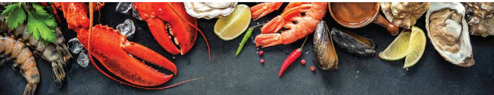
40406 • Lobster Bibs PL, 15" x 17" (cd/12)