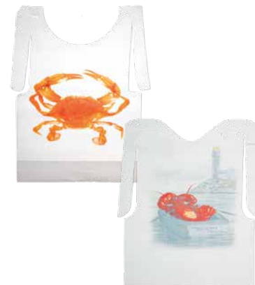
14510 • Crab Bibs PL, 15" x 17" (cd/12)