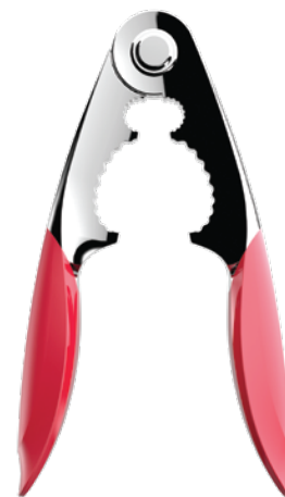
71006 • Lobster Cracker Chrome-Plated Zinc Alloy Silicone, 6 1/2" (cd)