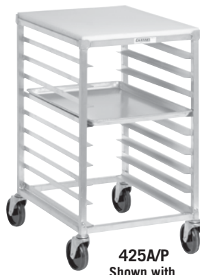
425A/P Shown with Optional Poly Top