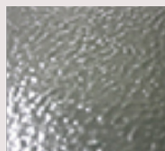
Embossed Gray Galvanized Steel