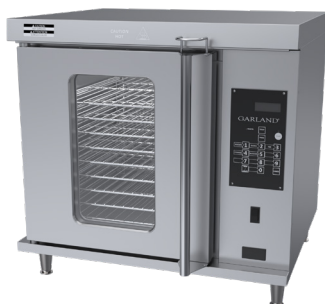
Model MCO-E-5-C with Optional Solid-State Digital Control