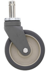
Rust Resistant 5PCX caster