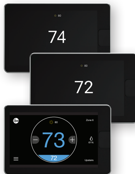
EcoNet Zone Control RECTL700ZON