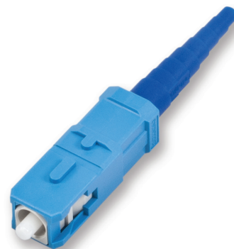
Part Number: 95-200-41