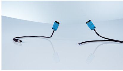
Different connection options to suit your needs