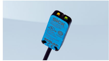
LED display simplifies commissioning