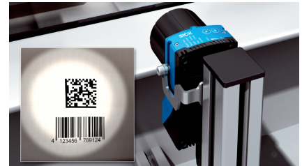
Traceability of products in the production process