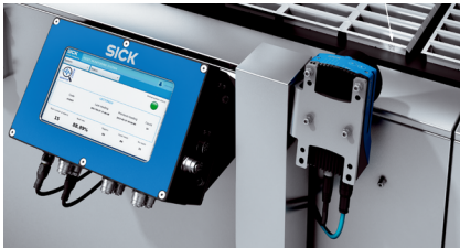
Identification of molds using the Asset Monitoring System

The Lector63x offers an optimum combination of performance and flexibility in a compact housing. It is ideal for applications which required high resolution, good scanning performance and high read ranges. The Lector63x detects small codes and codes on small objects with ease.