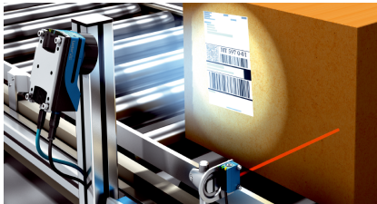
Automated box identification with image-based code readers