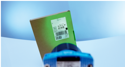
Acoustic and optical feedback. Immediate read feedback in all environments thanks to the green LED and acoustic signal.