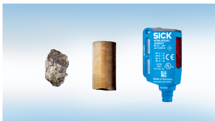
Rugged VISTAL™ housing offers maximum mechanical stability

The rugged VISTAL™ housing offers very high mechanical stability and therefore high sensor availability. The use of glass-fiber reinforced plastic combined with high-performance adhesives ensures excellent housing sealing and makes it resistant to cleaning agents. The laser inscription is easy to read even if the sensor has already been in use for years.