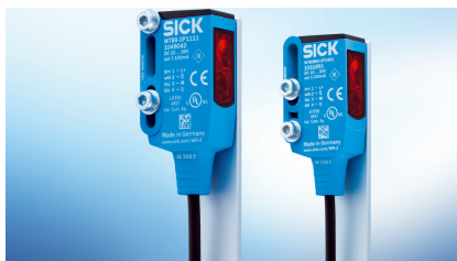
Housing variants for M3 and M4 fixing screws Slots make it possible to move the sensor on the screw