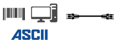
Scanners, Printers, and ASCII Devices

When you call, a live person answers the phone. When you talk with sales, you will get honest answers and recommendations. When you get support, it is from an engineer who had a hand in the product's development, and support doesn't require a ticket or 24-hour wait.