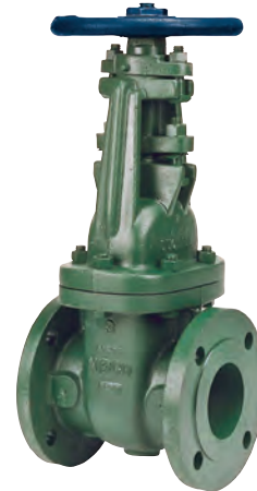
F-637-33 Flanged-Raised Face

Visit our website for the most current information.