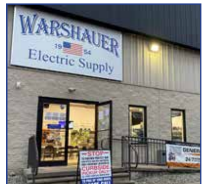
Lakewood 700 Vassar Avenue