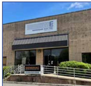
Parsippany 295B New Road