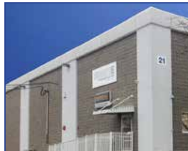
New Brunswick 21 Home News Row