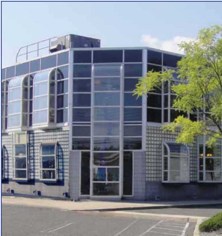
Tinton Falls (HQ) 800 Shrewsbury Avenue