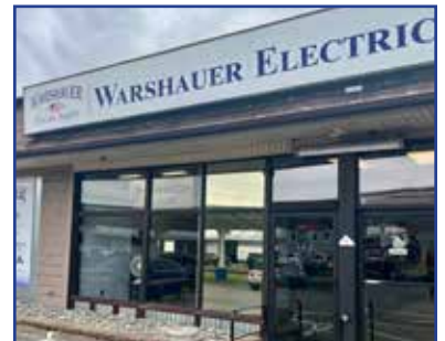
Woodbury 459 Mantua Pike